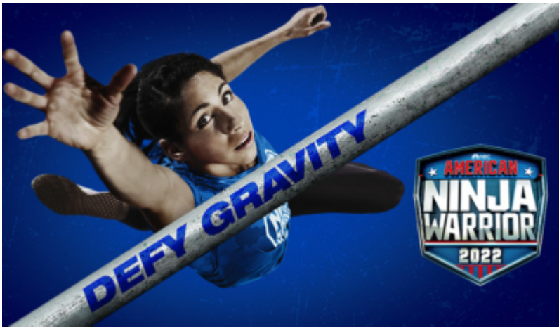
NBC American Ninja Warrior