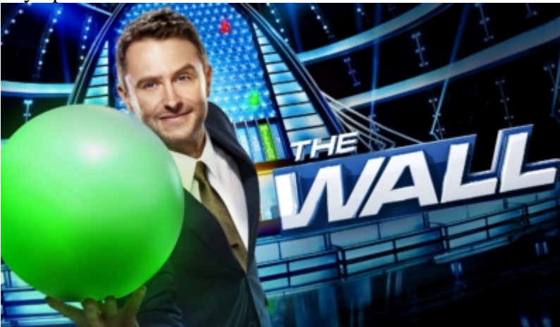
NBC The Wall