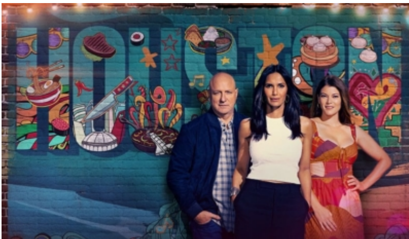
Bravo Bravo's Top Chef