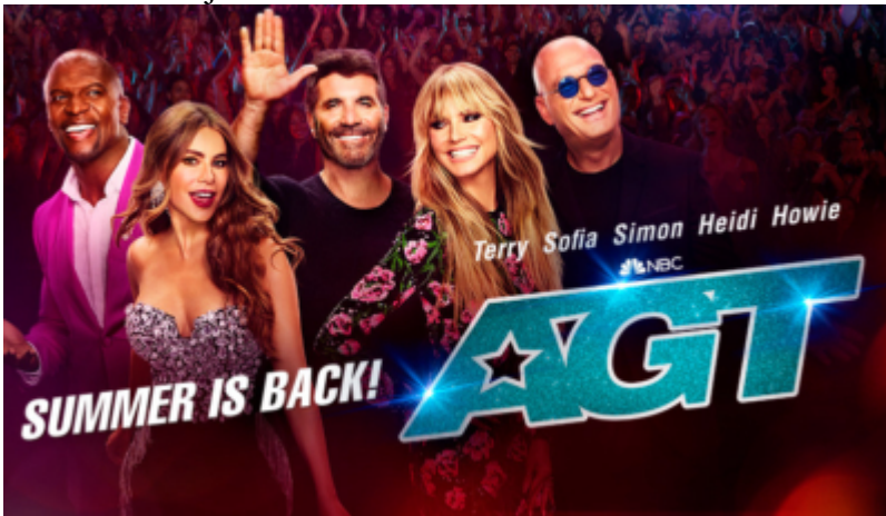
NBC America's Got Talent