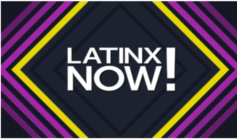
Telemundo Latinx Now!