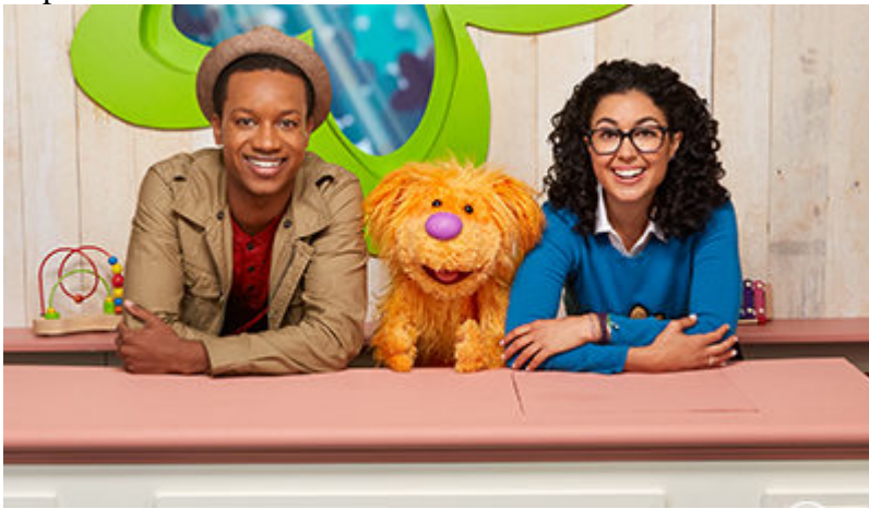
Universal Kids Snug's House

Thanks for getting all the way down here! Any thoughts or questions?