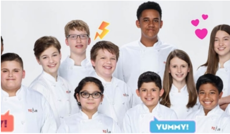
Universal Kids Top Chef Junior