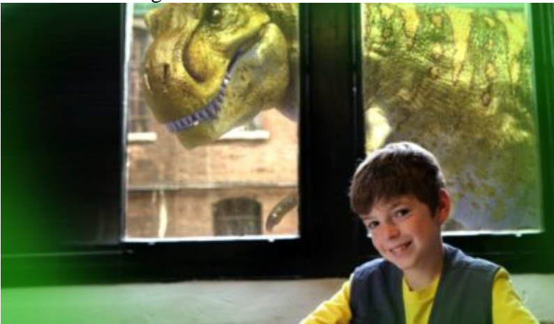
Universal Kids Dino Dan