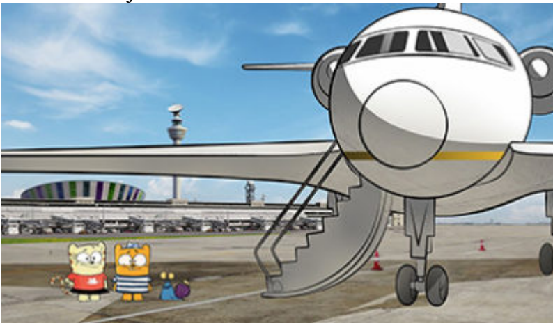
Universal Kids The Ollie & Moon Show