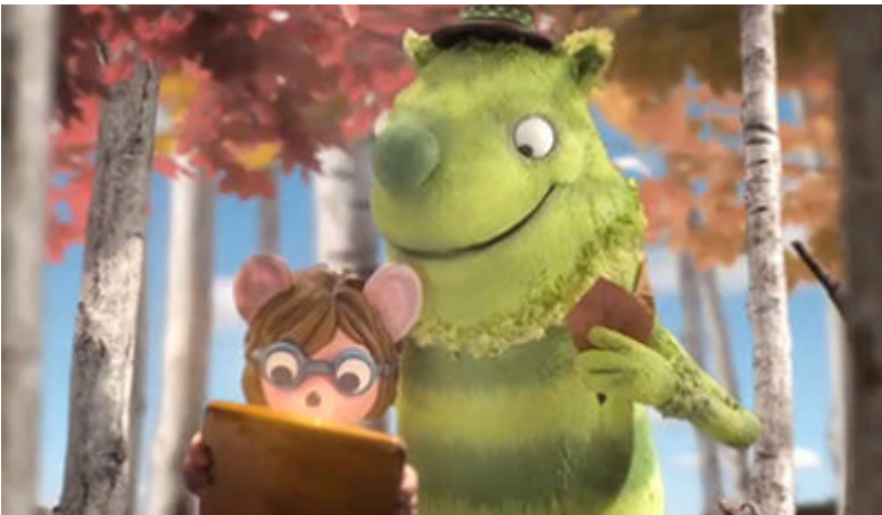
Universal Kids Norman Picklestripes