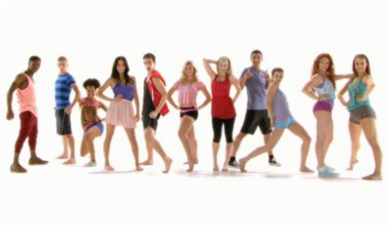
Universal Kids The Next Step