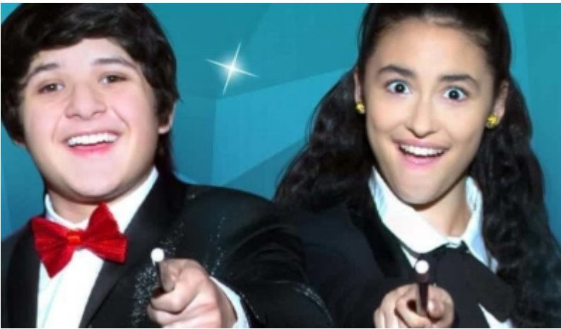
Universal Kids Junk Drawer Magical Adventures