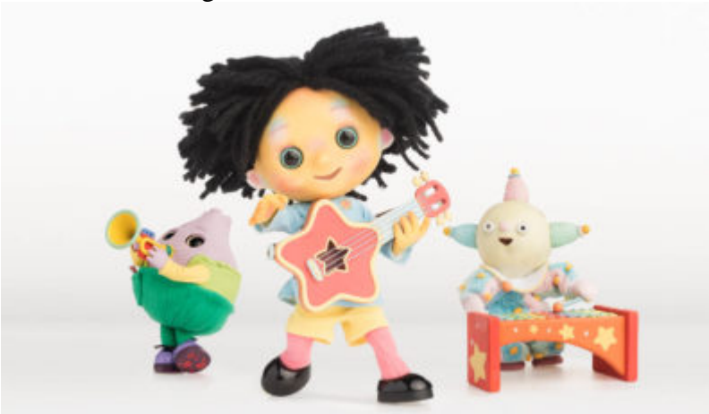
Universal Kids Moon and Me