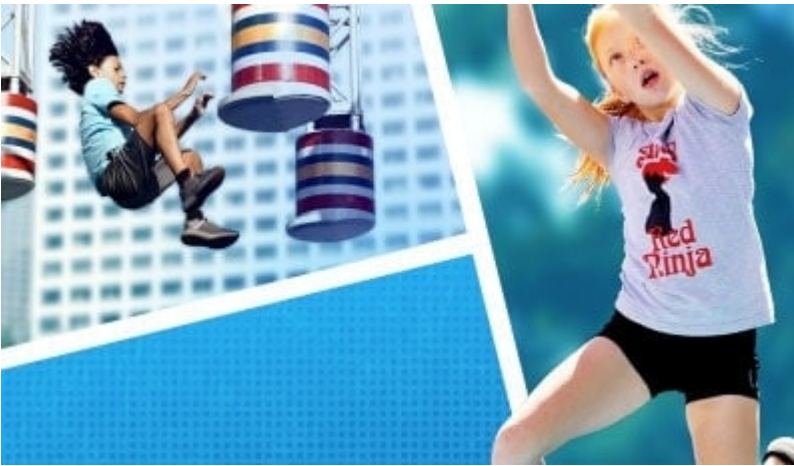
Universal Kids American Ninja Warrior Junior