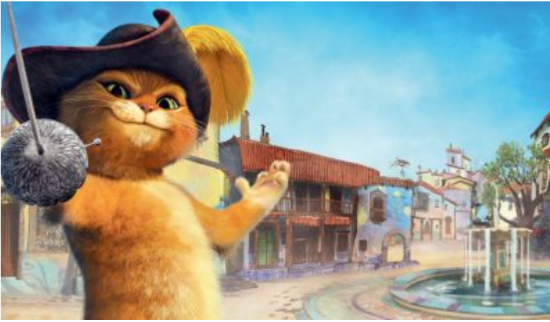
Universal Kids DreamWorks The Adventures of Puss in Boots