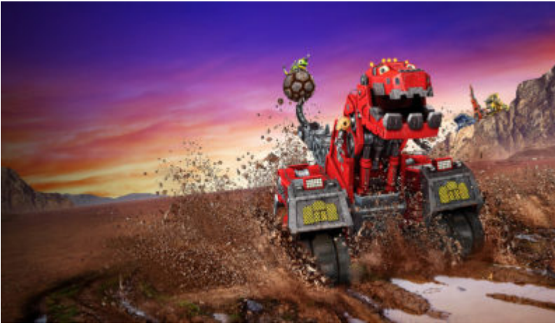
Universal Kids DreamWorks DinoTrux